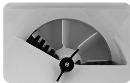
● The large