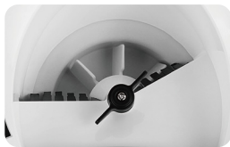
● The small

Note: The default wheel is the large one. There is also a small wheel, and you can change the wheel when needed.